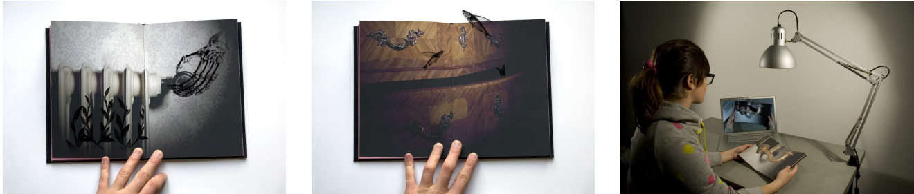
Figure 1: Two examples of animated illustrations from the Haunted Book, and the Haunted Book setup. A video demonstrating the system is available at http://chipchip.ch/interaction.html

Vincent Lepetit§ CVLab École Polytechnique Fédérale de Lausanne